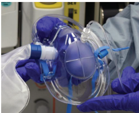
Figure. Procedural Oxygen Mask.

The high FiO 2 levels provided by the Procedural Oxygen Mask allow effective preoxygenation to be